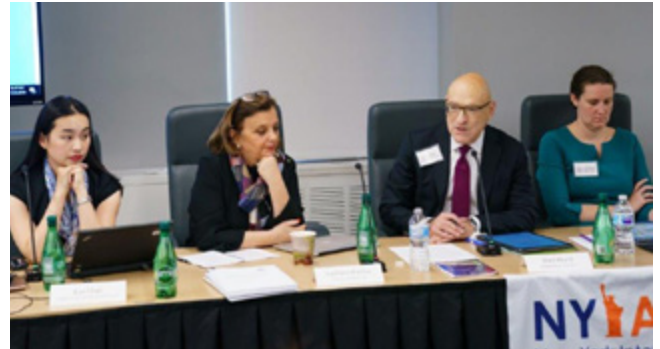
Panel discussion on the Cybersecurity Protocol, Nov 21, 2019 at NYIAC