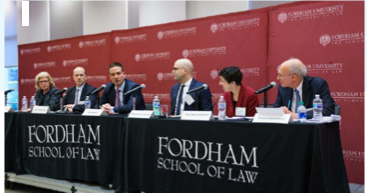
ICC Program on ICC Commission Report on Emergency Arbitrator Proceedings and emergency arbitration in practice, Nov 22, 2019 at Fordham Law School