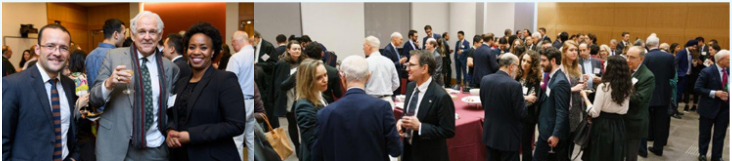
Reception closing another successful Fordham Conference and the inaugural New York Arbitration Week