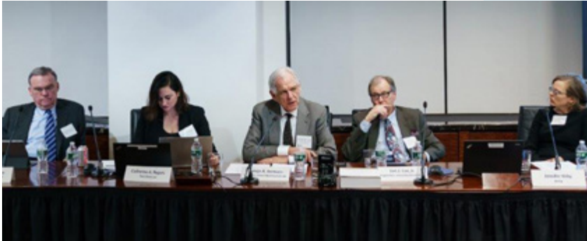
CIArb NY Branch two-panel, half-day program on the Restatement Third, US Law of International Arbitration, Nov 20 2019 at Sidley