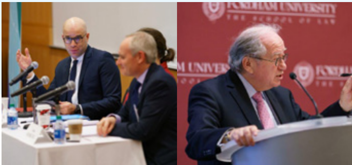
ICC Program on emergency arbitration