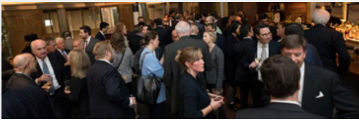
Opening Cocktails at Crimson & Rye, Nov. 19 2019

The inaugural New York Arbitration Week brought together leading academics, practitioners and arbitrators from around the world. All social events and substantive programs were fully subscribed in advance of the week itself.