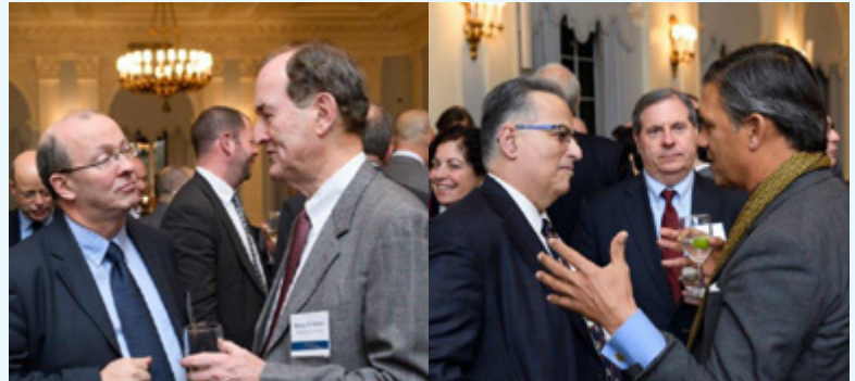
Conversations at the reception preceding the Gala Dinner at the Yale Club, Nov 20, 2019