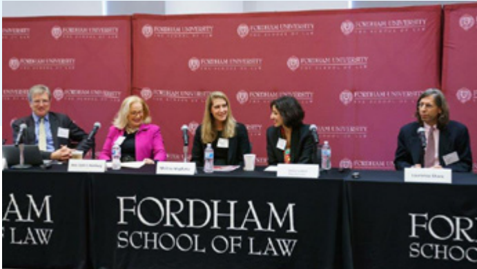
Panel on Contract Interpretation in International Arbitration, Fordham Conference, Nov 22, 2019 at Fordham Law School