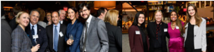
Opening Cocktails at Crimson & Rye, Nov. 19 2019